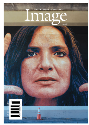
IMAGE is published by the Center for Religious Humanism, a nonprofit 501(c)3 corporation. www.imagejournal.org