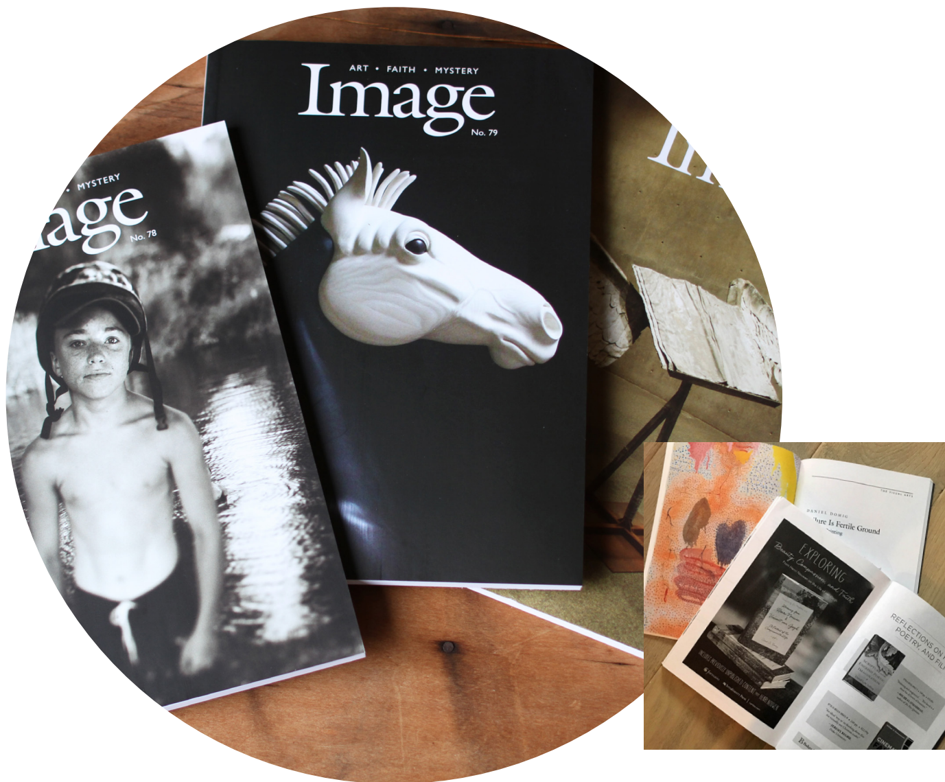
Image is a quarterly literary and arts journal which stands at the crossroads of faith and imagination. It is unique among literary publications not only for its focus on religion and art, but for its high production values. Image 's impact is directly related both to its content and to its outstanding graphic design. Readers see text printed on acid-free paper and visual art reproduced through the four-color process.

Image features fiction, poetry, memoir, and interviews, as well as essays on painting, sculpture, architecture, music, dance, and theater.