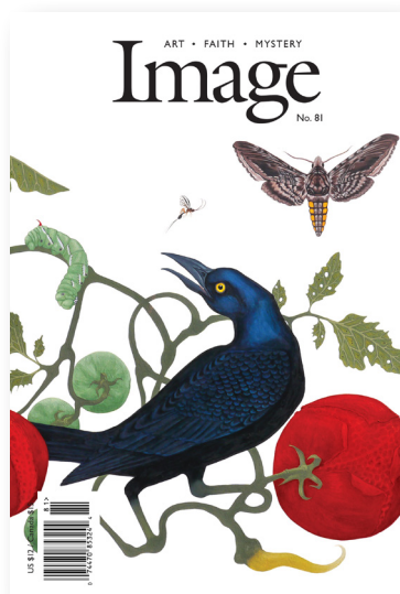
IMAGE is a quarterly literary and arts journal which stands at the crossroads of faith and imagination. It is unique among literary publications not only for its focus on religion and art, but for its high production values. IMAGE's impact is directly related both to its content and to its outstanding graphic design. Readers see text printed on acid-free paper and visual art reproduced through the four-color process. E-subscriptions to IMAGE are now available through Zinio.

IMAGE features fiction, poetry, memoir, and interviews, as well as essays on painting, sculpture, architecture, music, film, and theater.