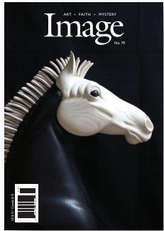
IMAGE is a quarterly literary and arts journal which stands at the crossroads of faith and imagination. It is unique among literary publications not only for its focus on religion and art, but for its high production values. IMAGE's impact

is directly related both to its content and to its outstanding graphic design. Readers see text printed on acid-free paper and visual art reproduced through the four-color process. E-subscriptions to IMAGE are now available through Zinio.