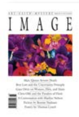
IMAGE is published by the Center for Religious Humanism, a nonprofit 501(c)3 corporation. www.imagejournal.org